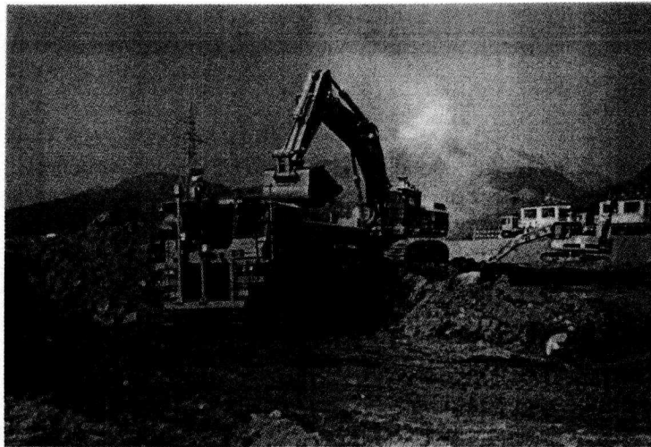
Fig.1 Tele-earth Work System at Foot of Mt. Unzen-Fugen

Several years ago, Mt.Unzen-Fugen volcano in Kyusyu Island made big eruptions and hundred millions of tons of hot soil and rocks have flown down, many houses were damaged and some people were killed. The volcano is active even today, and the Ministry of Construction asked general constructors to restore disaster area with introducing wireless remote control construction machinery and operate them from separated safe places. Fig.1 shows a scene of earth work with remote controlled unmanned earthwork machineries.