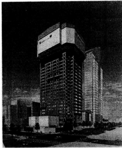
Fig.2 Automated Weather-Unaffected Building Construction System

general contractors, and it is anticipated to become a new wave of building construction. Fig.2 shows an example of this system.