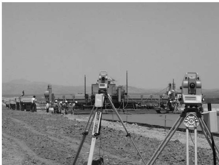
Figure 6: Robotic total stations tracking retro-reflective prisms on the paver and providing XYZ positioning

The committee developed a set of guidelines based on delivery of electronic files after award (Caltrans 2005). A pilot project was developed in District 11 on the second stage of a bypass around the town of Brawley in Imperial County (Caltrans 2004). State Routes 78 and 111 are being rerouted to reduce traffic on city streets. Originally the electronic design files were to be provided to bidders on the project before award. Due to concerns by the Division of Construction the files were delivered after award. Construction did not start until June 2007 and is expected to be completed by 2010. A “lessons learned” document will be completed when the majority of the work is done.