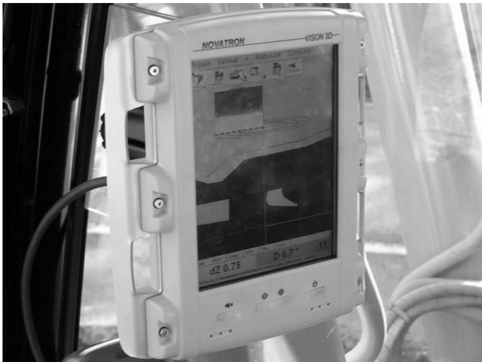
Figure 3: 3D control of excavators in the test of 3D ROAD – user interface

Three-dimensional laser scanning enriches the geometric measurements taken during various stages of bridge construction and improves their efficiency and precision. By utilizing the developing technique of bridge scanning, the measurements of the starting data can be expanded further and thus produce more