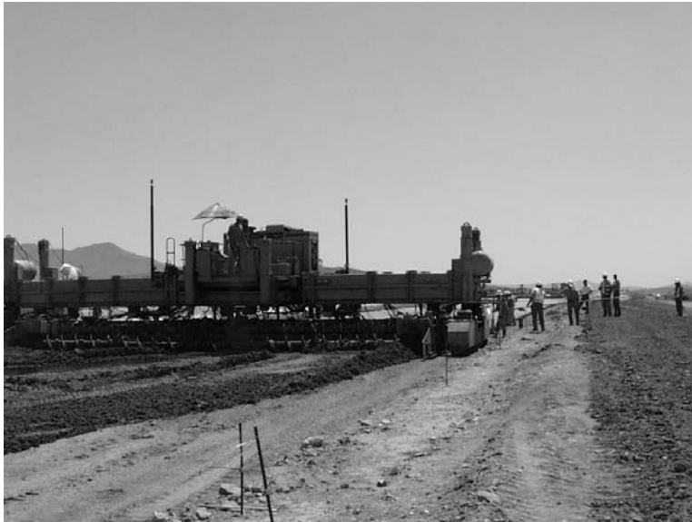
Figure 5: Concrete paver, automated construction on I-15 near Barstow, CA

design is finished. Lines are not interactive with the cross-sections, and if a flaw is discovered they must be recreated. New road design software is being evaluated but has not yet been purchased. A change in software should make it easier to create files needed by the contractors.