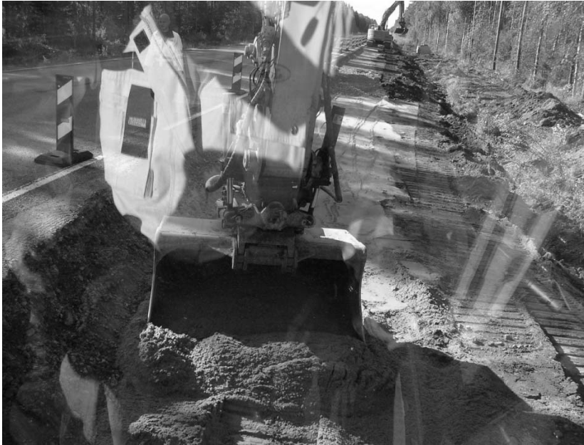
Figure 2: 3D control of excavators in the test of 3D ROAD

throughout the total operating process of bridge building. The research and development focused on the development of 3D laser scanning and GPR scanning of bridges, the transfer of measurement results and road geometry to the 3D product modeling of bridges (see Figure 4), the development and improvement in the efficiency of road design based on product modeling, the diverse utilization of product model data in quantity surveying and cost accounting, scheduling, and procurement planning and management of construction work, and in 3D measurements used to control and validate (QA/QC) construction.